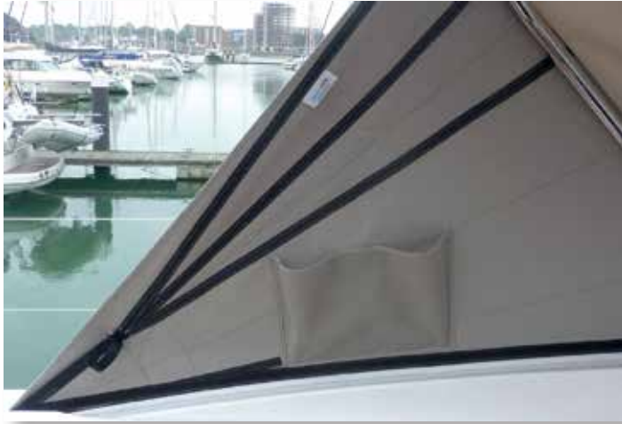
Mesh side pockets in the sprayhood wings.