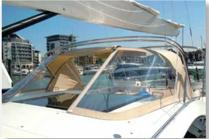
A zip-up front is available as an upgrade.