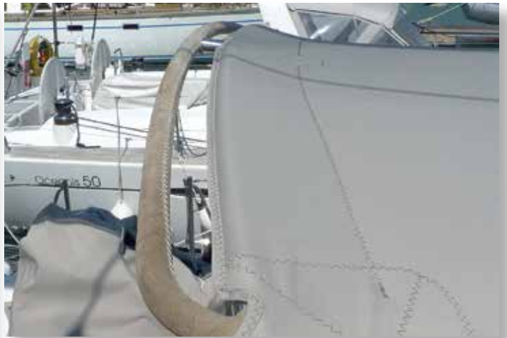
A welded grab rail. This can be with or without leather.