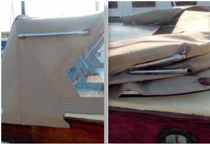
This popular upgrade of side hand rails makes it safer when leaving the cockpit - they are available as a fixed or folding option