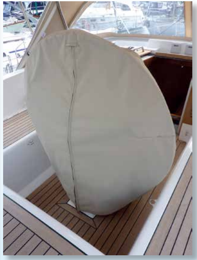
Combined Wheel & Pedestal cover