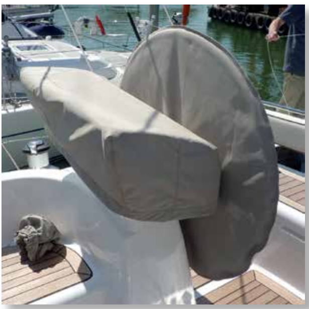
Individual Wheel & Pedestal cover