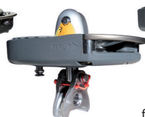
HR 3:1 friction sheave