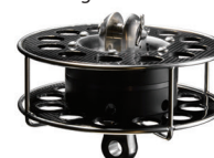
Single line drum