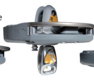
Quick release 3:1 friction sheave (NEW)